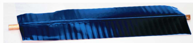
Selective Covered Wing